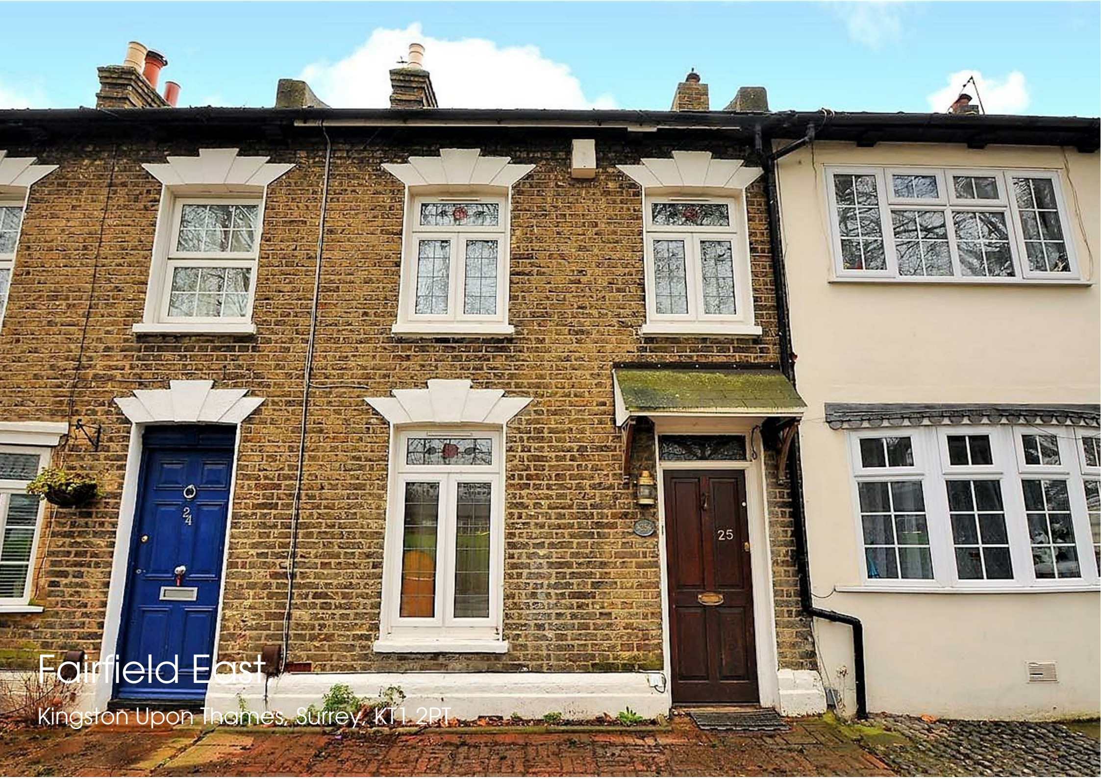
Fairfield East Kingston Upon Thames, Surrey, KT1 2PT